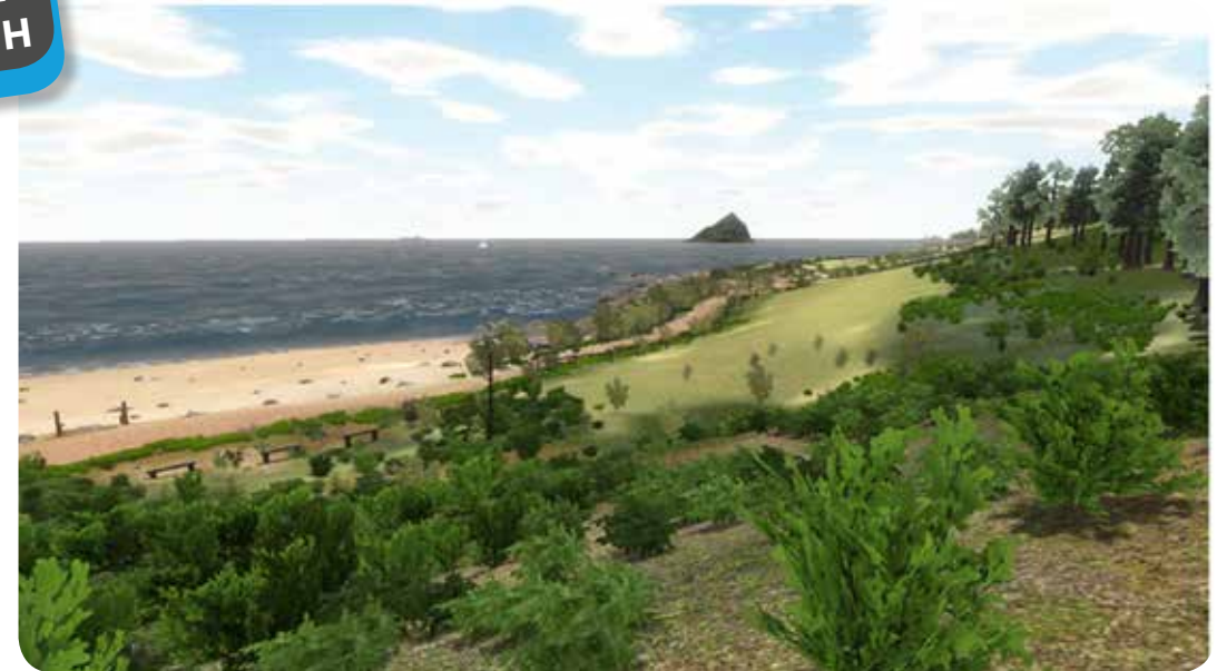
A virtual reality environment used in a study simulating dental experiences and people's recollection of pain (Tanja-Dijkstra et al., 2014).

Wyles, K.J., Pahl, S. and Thompson, R.C.T. (2015) Factors that can undermine the psychological benefits of coastal environments: exploring the effect of tidal state, presence and type of litter. Environment and Behavior , 1-32. doi: 10.1177/0013916515592177